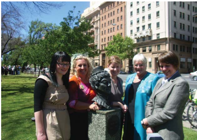
9 October Press Conference at the Mary Lee Statue North Terrace

Alongside the standout issues of Paid Maternity Leave and Pregnancy Counselling, I continued to work on issues including women's representation, gender equity and the wage gap, domestic violence and initiatives such as White Ribbon Day.