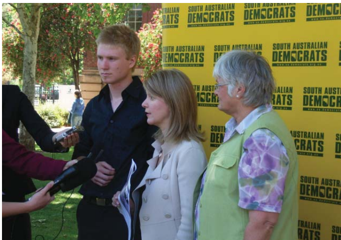
Higher Education Policy Launch at University of Adelaide

I also conducted a Federal Election Youth Poll, to gauge young people's opinions and ensure that their views were included in the political process.