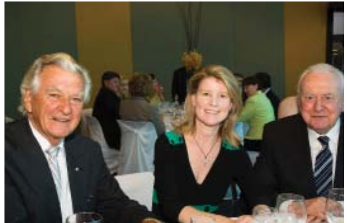
Opening of Hawke Building, University of South Australia, 11/10/2007