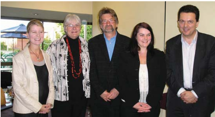
Higher Education Forum chaired by Natasha Stott Despoja, November 2007