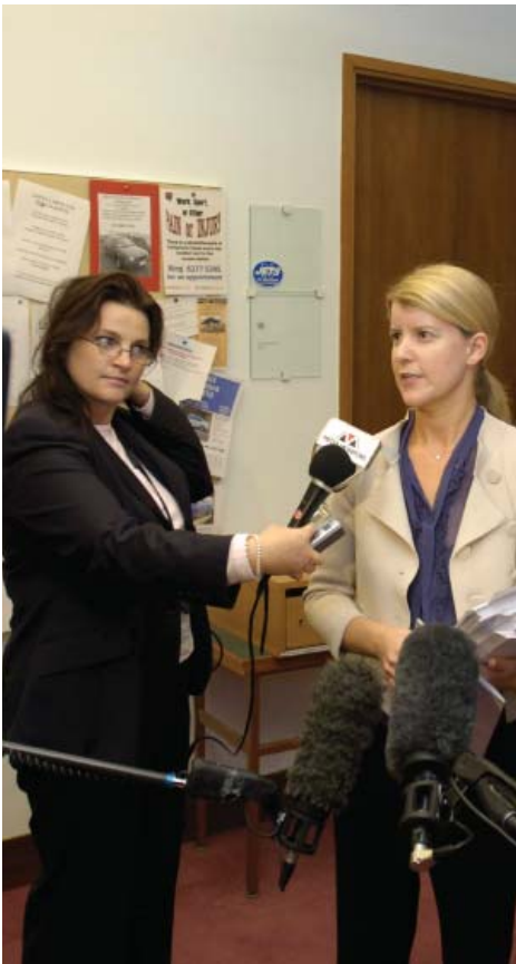
Releasing the Pregnancy Counselling Petition at Parliament House

I have called on the Rudd Government to hold a new plebiscite on a Republic to coincide with the planned reconciliation referendum in 2009.