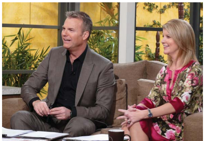
Co-hosting 9am with David Reyne